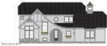
Listing courtesy of: Roohan Realty

180 Route 9p Saratoga Springs, NY 12866 $1,605,900 Bedrooms: 4 Bathrooms: Full 2, Half 0 Bathrooms 1/2: 1 Square Feet: 0