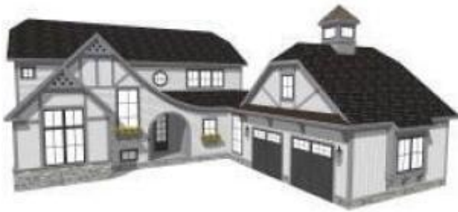
©2022 Global M.S.